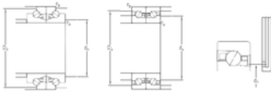
BTM 70 BTN9/HCP4CDB Bearing 2D drawings and 3D CAD models